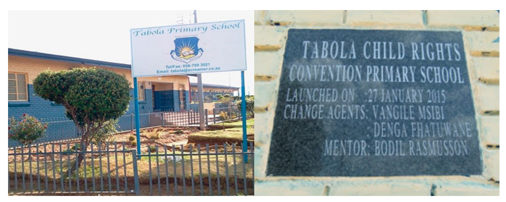
Tabola Primary School